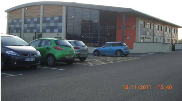
The new Sports hall

To our many ex-students who left more than 5-6 years ago there will be significant visual changes as shown on the following photographs.