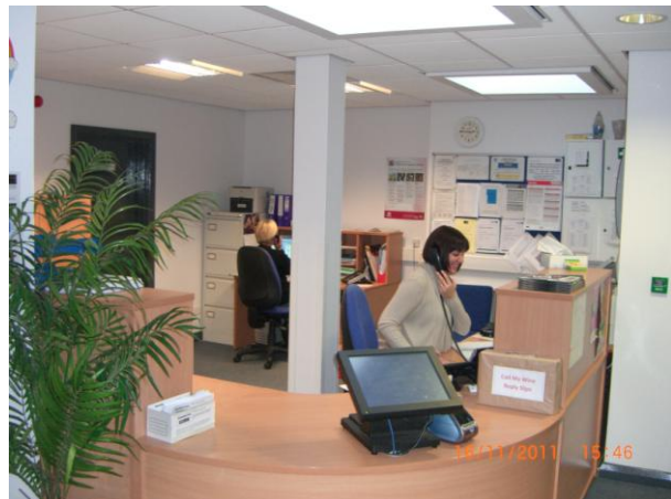
The new Reception