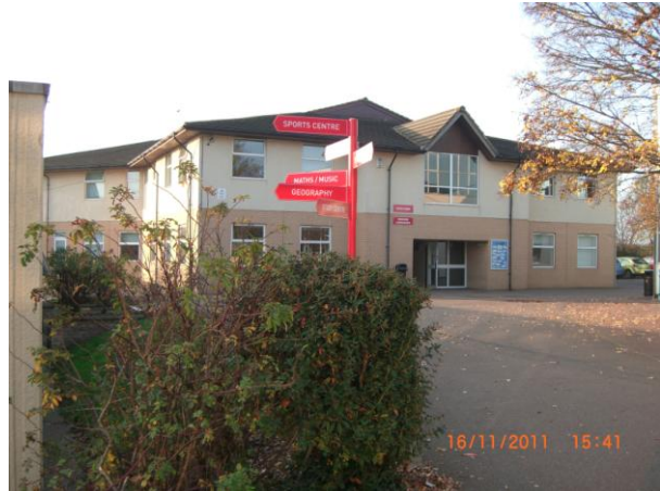
Sixth Form & Modern Foreign Languages building