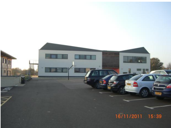
New Maths Building